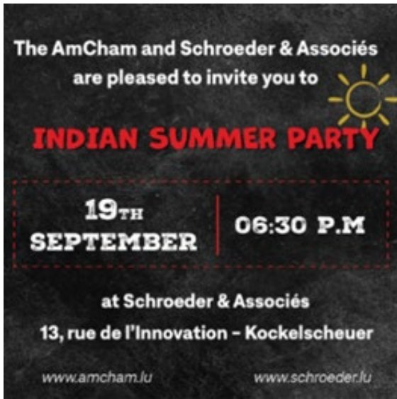
Indian Summer Party | 19.09