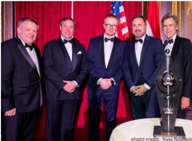
Prince Guillaume, Minister Bettel celebrate Award-Winning Company Redwire