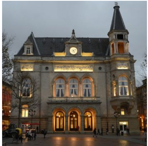
Thanksgiving Gala Dinner | 22.11