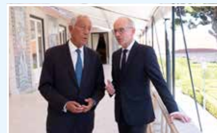
Visiting the Portuguese President in July 2023

He did not take this decision lightly. The decision-making process took three weeks before he agreed and gave up all his positions, at the bank, at the Chamber of Commerce and at the law firm. He wanted to be able to devote himself fully and unconditionally to his new, old role as a politician.