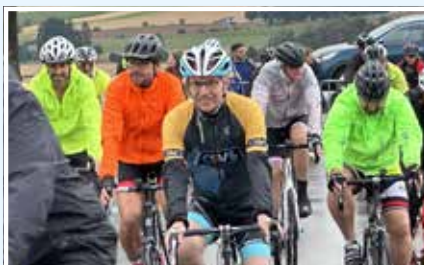
Luc Frieden rides on the campaign trail

Was this career predetermined? No. Luc Frieden grew up as the son of an Arbed employee and a teacher in Esch/Alzette. He attended the local school, played with the kids of the neighbourhood, went to music school and to the swimming club.