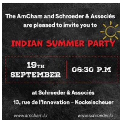
Indian Summer BBQ Party 19.09