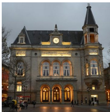
Thanksgiving Gala Dinner 22.11