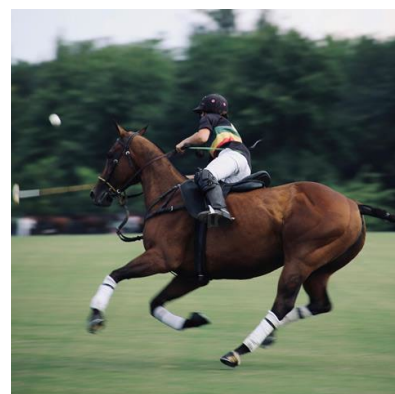
International Roude Léiw Polo Cup 06-07.07