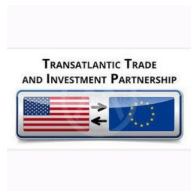
Transatlantic Trade and Investment event 2024 27.11