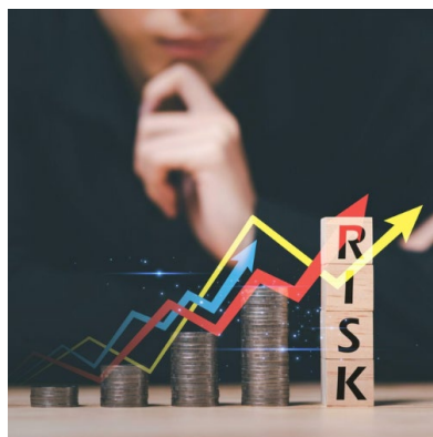
Risks for the Fund Industry 03.06