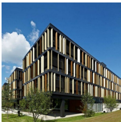
"Pension Planning" event 03.07