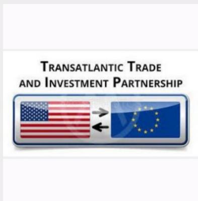
Transatlantic Trade and Investment event 2024 | 27.11