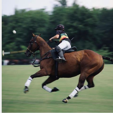
Sixth International Roude Léiw Polo Cup | 06-07.07