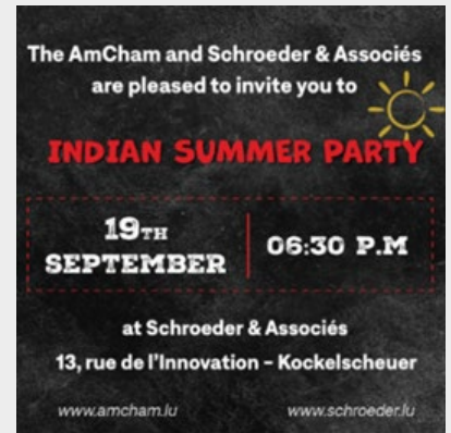
Indian Summer BBQ Party 19.09