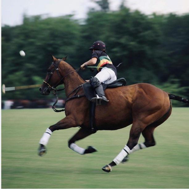
International Roude Léiw Polo Cup