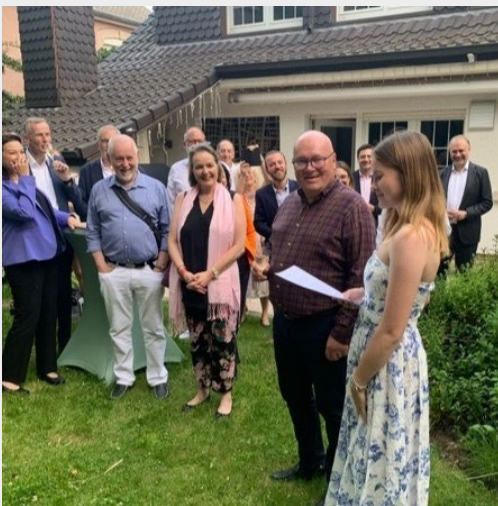
Polish Ambassador Returns to Poland