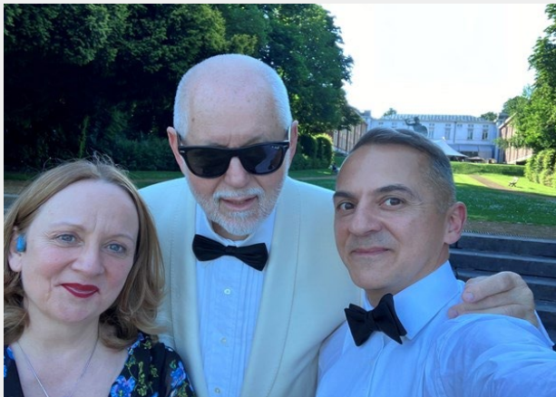
Amcham EU Annual Gala 2024