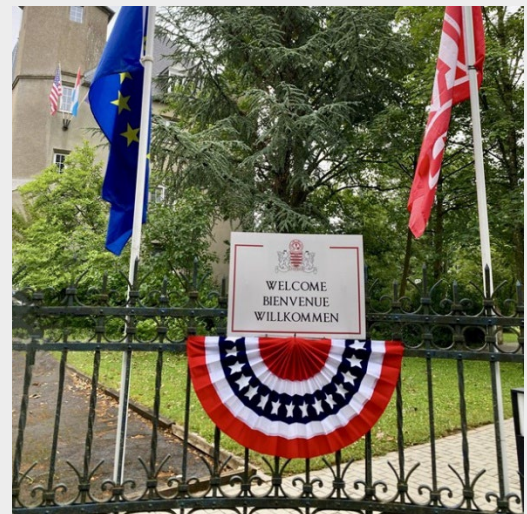
Miami University End of Summer Term