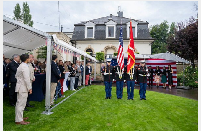
US Embassy Independence Day