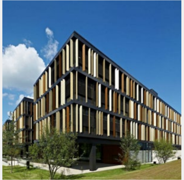
Pension Planning Event