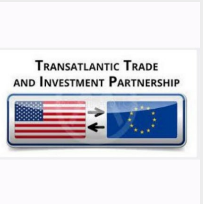
Transatlantic Trade and Investment event 2024 | 27.11