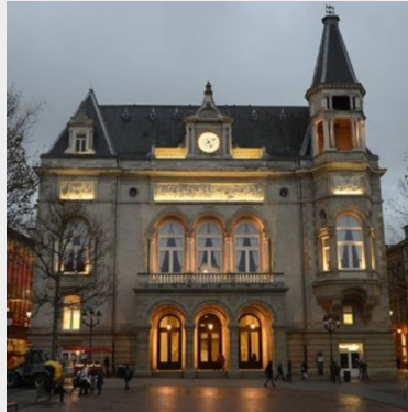
Thanksgiving Gala Dinner 22.11