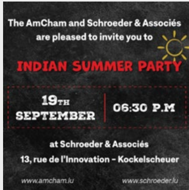
Indian Summer BBQ Party 19.09