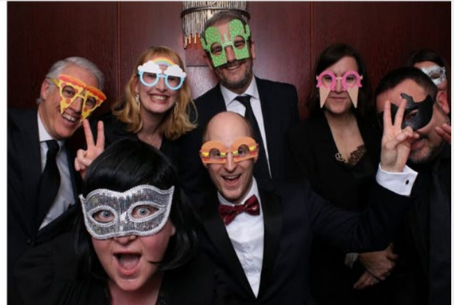
Photo Booth Gallery